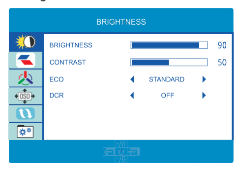
Figure 5-2 OSD screen

<u>Step 3</u> Press ▼ or ▲ to browse through the functions.